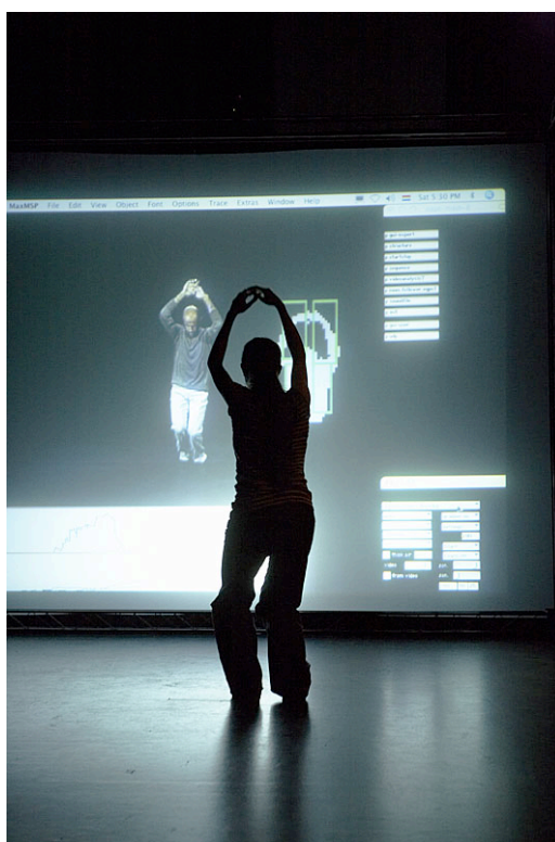
Fig.8 Emio Greco | PC, with Bertha Bermúdez, Double Skin/Double Mind , installation (2007).

What is implicit in my account of this work in the first years of the new century (2001-2005) is the inevitable concern that evolved for shifting “interactivity” away from the trained performer (acting as if on a stage) to the audience and the “user” of participatory/interactive systems. Choreographers involved in recent research projects have shifted their attention to audience empathy and direct engagement, and Emio Greco | PC’s installation Double Skin/Double Mind (2007) is one example of a company opening their physical movement practice to audiences invited to learn or enact some of the principles of choreographic, generative processes – inner intentions as well as the outer shape of gestures and phrases. The company installed an