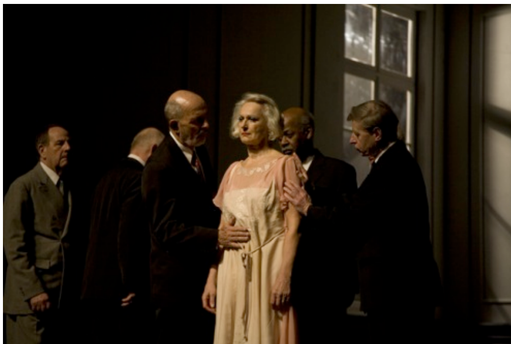
Fig. 6 Pina Bausch Wuppertaler Tanztheater, Kontakthof [1978], presented with non-professional cast aged 65 and over, Barbican Theatre London, 2010 © Photo courtesy of Vanja Karas.

so for many years (e.g. Café Müller , Nelken and Kontakthof are of course still in the repertoire, even as some of the initial cast are now in their 40s and 50s, and Bausch continued to work with them as well as creating a version of Kontakthof with non-professional dancers over 65 years of age).