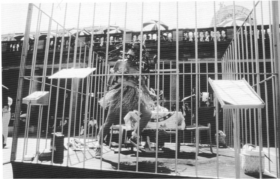
Fig. 1 Guillermo Gómez-Peña/Coco Fusco, The Couple in the Cage: A Guatinalui Odyssey (1992)