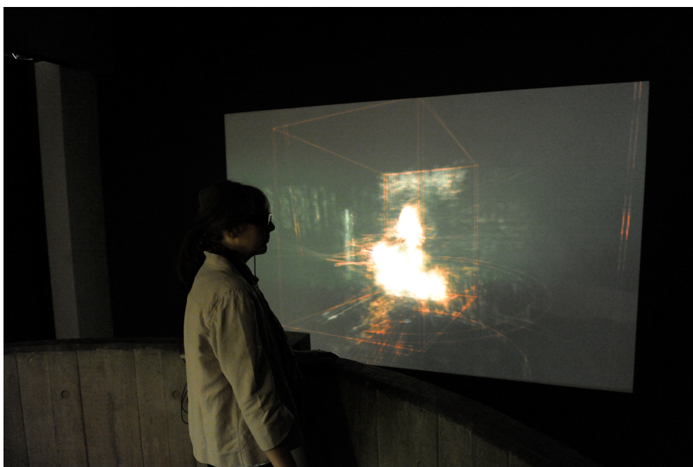
Fig.11 A visitor “interacts” with OpenEnded Group’s digital 3d installation Stairwell in Move: Choreographing You .